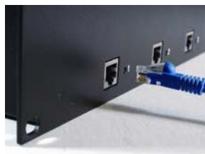
Standard CAT5 connectors

Presentations, slide shows, schedules, and other types of common information can be centrally generated and displayed simultaneously on all remote monitors. The serial and audio models can distribute these signals to the remote stations.