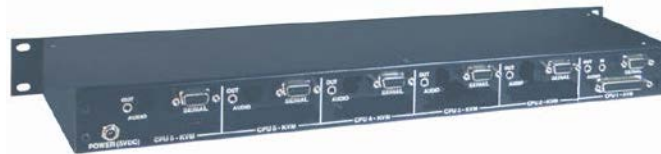
Rear View (Serial/Audio model)

■ Phone: 281-933-7673 ■ E-mail: sales@rose.com ■