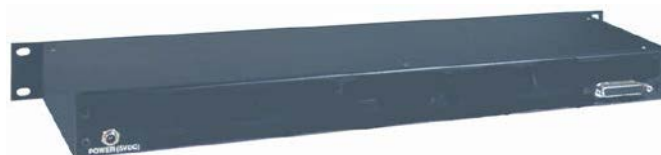
Rear View (Video only model)